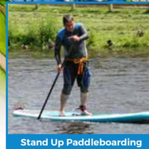
Stand Up Paddleboarding