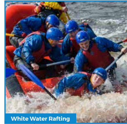
White Water Rafting