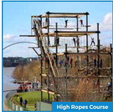
High Ropes Course

We pride ourselves on delivering a fantastic experience for any occasion and can cater for everyone regardless of their budget or group size.